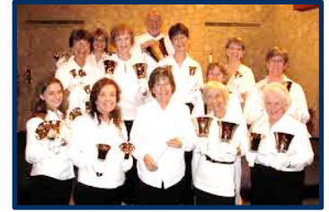
"The Bells of St. Andrews Handbell Choir"

TUESDAY, MARCH 17, 2020 at 8PM "SPRING SPECTACULAR CONCERT"